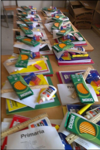
From loving hands who assemble kits— to precious hands who need them!

Our mission: to support, encourage, and release FAITH in the needy and less fortunate