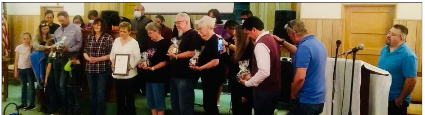
Pastors, missionaries, and ministry suppliers being prayed over as we all thanked God for His faithfulness