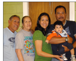
Thank you, Jesus!