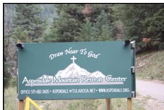
Aspendale Baptist Encampment