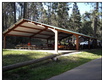
LaLuz Bible Church Weekend Retreat in Lincoln Forest