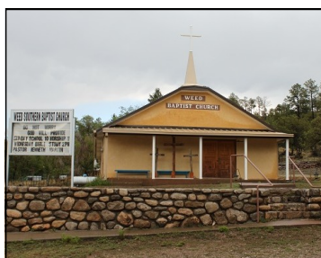
Weed Baptist Church