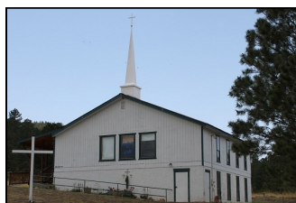
Mountain of the Lord Faith Fellowship