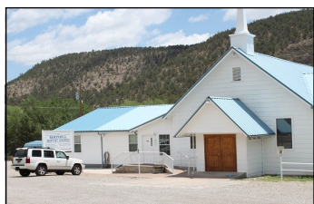
Mayhill Baptist Church