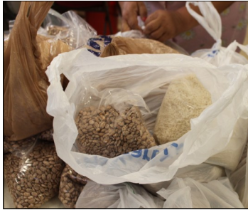
Beans and rice every Tuesday