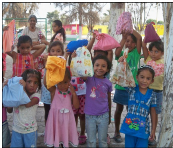
Hygiene kits to VBS kids