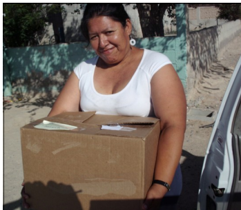
Emergency food to displaced families