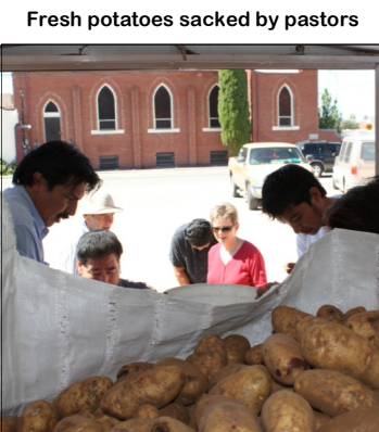
Fresh potatoes sacked by pastors

This March will mark the 12th anniversary of Crossing Borders. In looking back through the years, there are so many stories we could share with you, all because the Lord has been so faithful! We have been able to supply pastors, their families, and the needy in their communities with rice, beans, groceries, clothing, school supplies, Christmas presents, Bibles, Bible Study materials - and the list goes on.