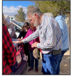
Every vehicle was prayed over before it went across, asking the Lord to see all the gifts safely into kids' hands