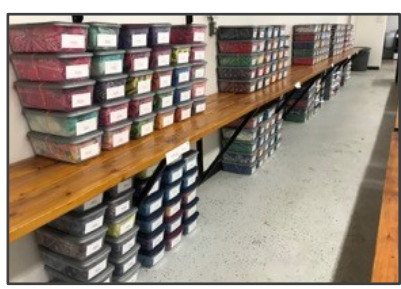
.... to loaded and ready to cross into Mexico takes a three week process to get it all done.