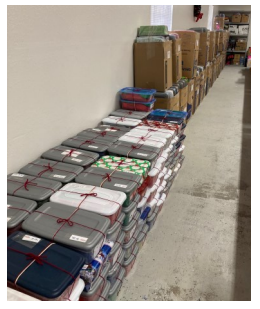
Dorm wall filled with gifts ready for shipping out

Just one of the shoebox aifts ready for Mexico