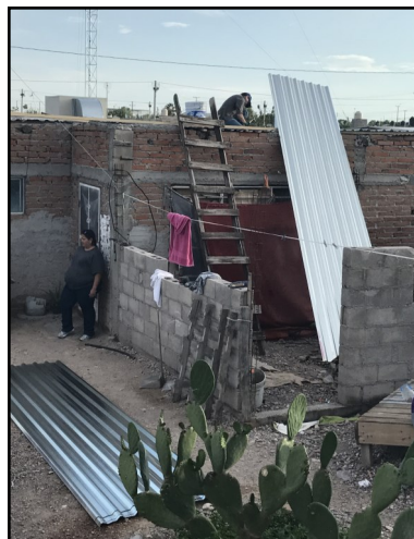
A new roof for a faithful pastor