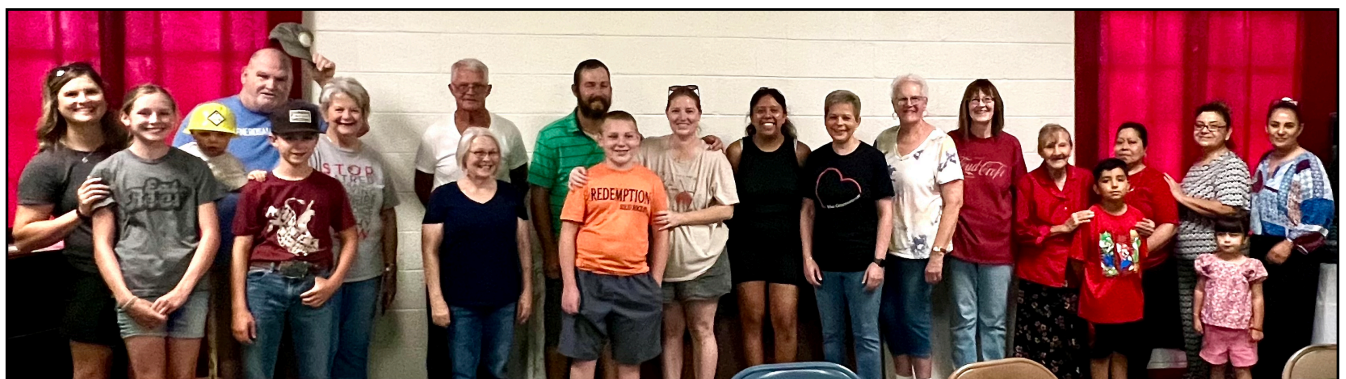
School Supplies Volunteer Crew for our work week, along with our ladies from church who made a delicious lunch for us every day