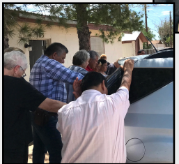
Praying over vehicles for safe crossing into Mexico

Thank you for each person who helped us bless so many children with the opportunity to go to school this year!