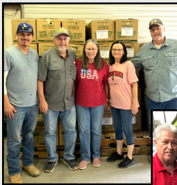
Delivering boxes of school supply kits to CBM warehouse