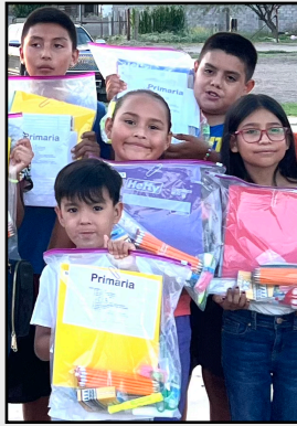
Blessing children in Mexico