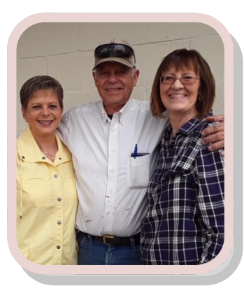
Happy reunion with our 'Saint James' from Lake Leon, TX