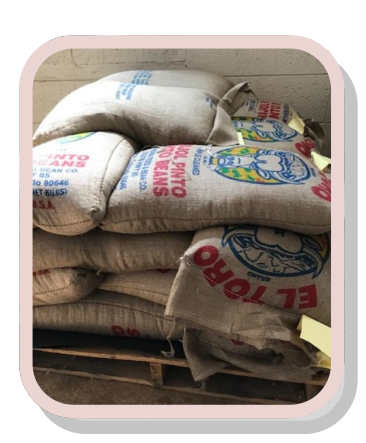
50# sacks of beans are now costing us $33.00 a sack & prices are climbing!