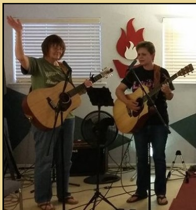
Leading worship at JHOP in El Paso