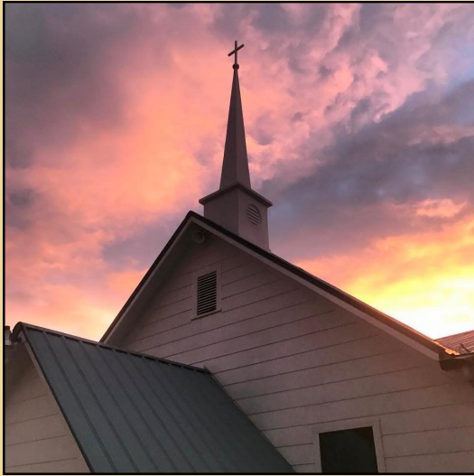
Sunrise over Mayhill Baptist